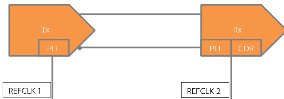
Figure 3: Independent REFCLK Architecture (IR)

The Independent REFCLK architecture, formerly known as Separate Clock architecture, defines separate reference clocks for Tx and Rx as shown in figure 3 below.