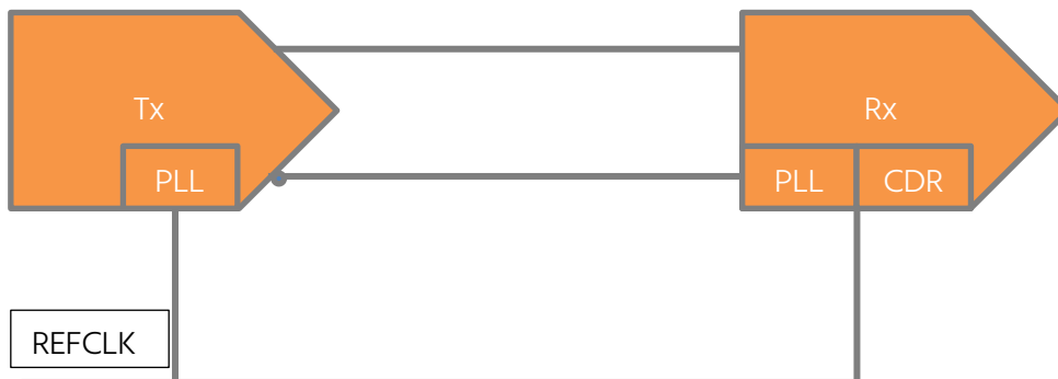
Figure 1: Common REFCLK Rx Architecture

In the Common REFCLK Rx architecture, both link partners use the same REFCLK as shown in figure 1 below. This architecture is the most widely supported clocking method.